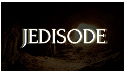
Jedisode — Audio Webisodes (Starting 3/2020)