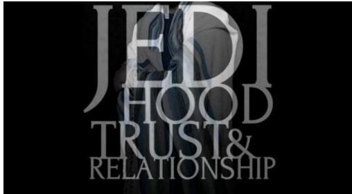
Jedihood — Original Video Series (3/2016 – 3/2017)