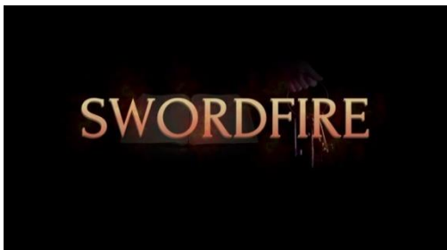
Swordfire — Video Series (5/2017 – 10/2017)