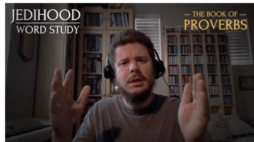
The Book of Proverbs — Study Series (9/2020 – 2/2021)